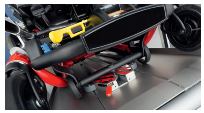
The system is automatically fixed on the ambulance table.