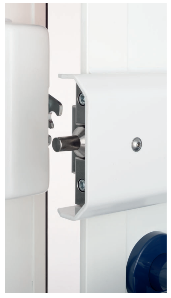
After engaging the closing system, the door automatically is pulled in the seals: silent and vibration free!

To make the patient compartment less noisy and thus to reduce any further stress to patients, WAS has developed different systems. The new WAS Door Assist system assures the silent closing of all box body doors. Instead of just slamming the doors – which is a very noisy process – the rescuer just has to bring the door to the first closing position. Then the door is automatically pulled in the seals – silent and vibration free. The doors are closed safely and cannot spring open again.