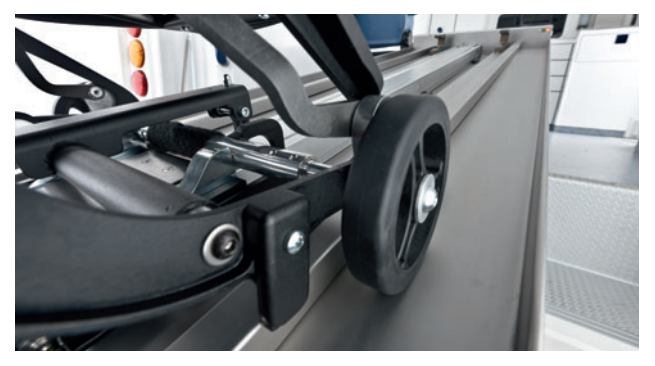
The move-in carriage which is suitable for any stretcher system assures a safe locking.