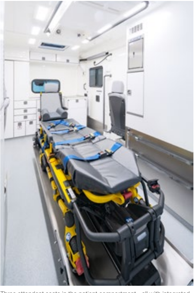
Three attendant seats in the patient compartment - all with integrated three-point seat belts, seat indicator and seat heater (option) – enable a comfortable treatment of the patient.