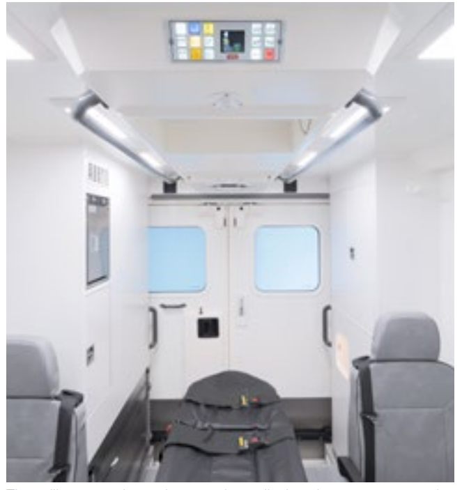
The ceiling centre is used to contain medical equipment, energy and oxygen supply as well as the central panel used to control the ambulance table and further essential functions.