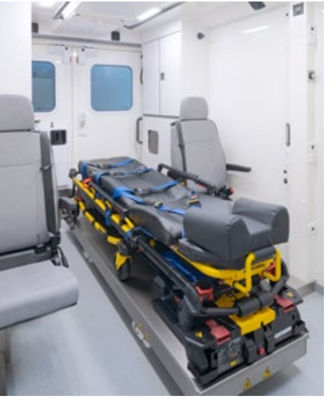
The touchpanel on the left hand side allows the attendant to control all of the main functionalities while sitting, which leads to a much higher safety for the attendant during operation.

The concept is transferable to other base vehicle types. The equipment is an example and can be customised.