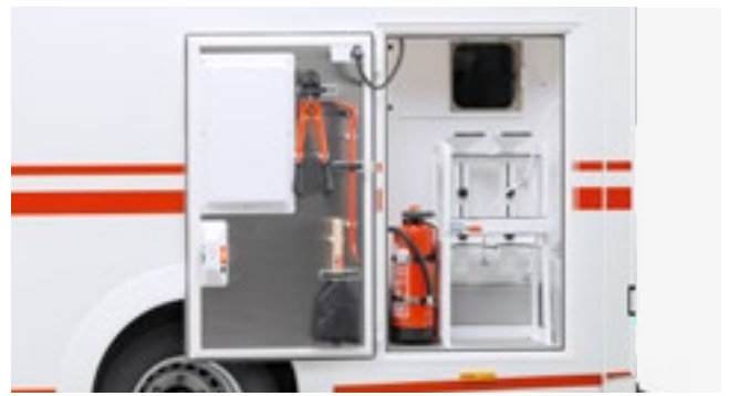
Compact and ergonomical: Oxygen supply and rescue tools in the large exterior storage compartment.