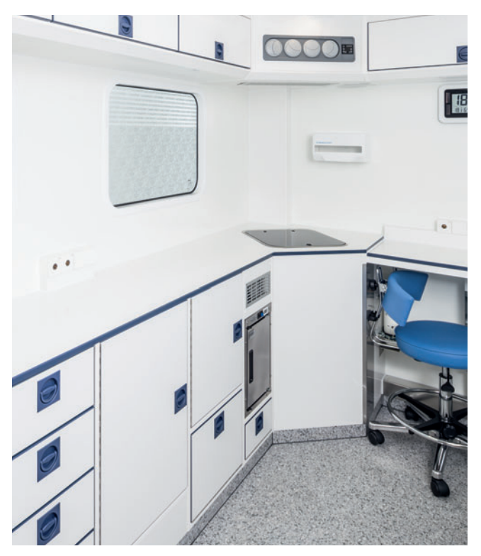
The wash basin can be easily covered to make additional work surface.

The concept is transferable to other base vehicle types. The equipment is an example and can be customized.