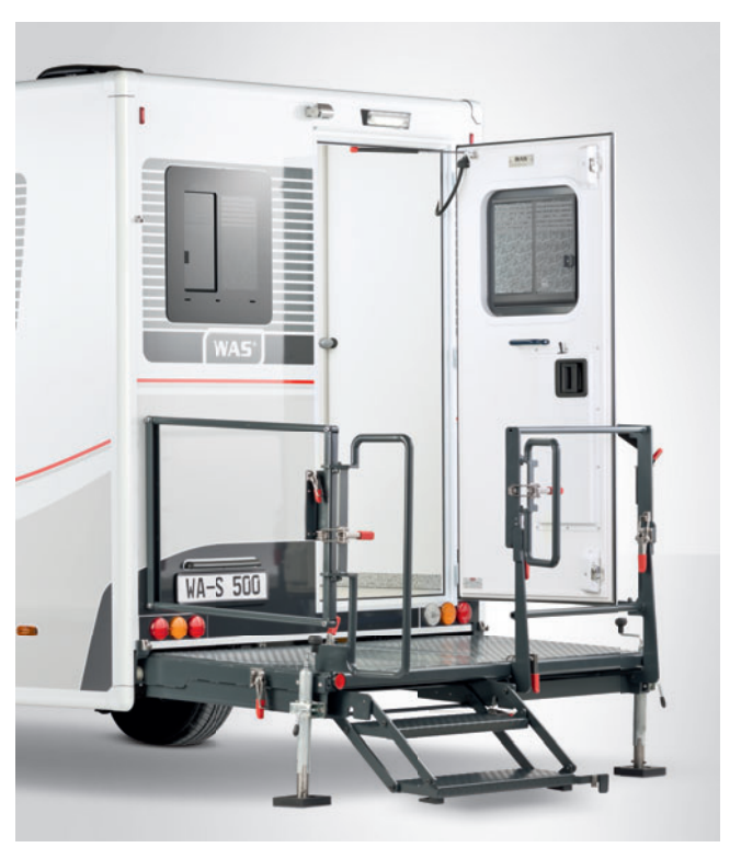
Comfortable, safe and easy to deploy rear access structure (optional).