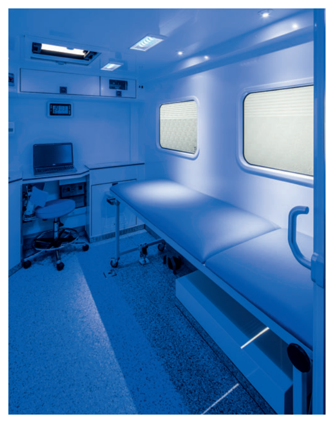
The lighting can be switched to relaxing blue light.