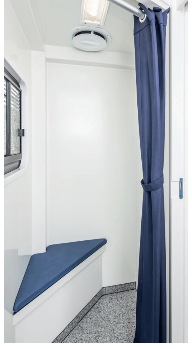
The dressing room is spacious and can be closed with a curtain for privacy.

Not only the changes in demographics and advances in mobile medical treatment are some of the challenges that face the modern medical services. Also the medical attendance of refugees requires solutions. That is the reason why we have made medical treatment mobile. The mobile medical practice is a fully equipped doctors practice on wheels. It is suitable for various medical fields, for the use at large social events (instead of emergency ambulances) and for medical pre- and post-care. With a total vehicle weight of 3.5 T, it can be driven with a normal car driver's license. Due to its modular furniture the mobile medical practice can be easily adjusted to the sensitive demands regarding the diagnosis and medical care of refugees. The separated dressing room enlarges the comfort zone especially for patients with cultural preconditions. The modular box body is crash tested according to EN 1789 and is equipped with modern, energy efficient LED lighting, doctor's spots and blue calming trauma lights. An independent vehicle heater and 230-V-airconditioning ensure pleasant temperatures during all seasons. The box body is highly energy efficient due to excellent insulation.