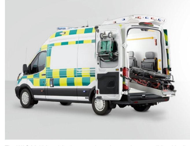
The WAS Multi-Load Assist move-in assistance is compatible with all standard roll-in stretchers.