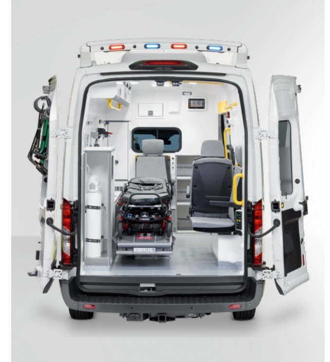
The patient stretcher can be easily moved into any position required.

Warning FM radio system for surrounding traffic while an ambulance is approaching