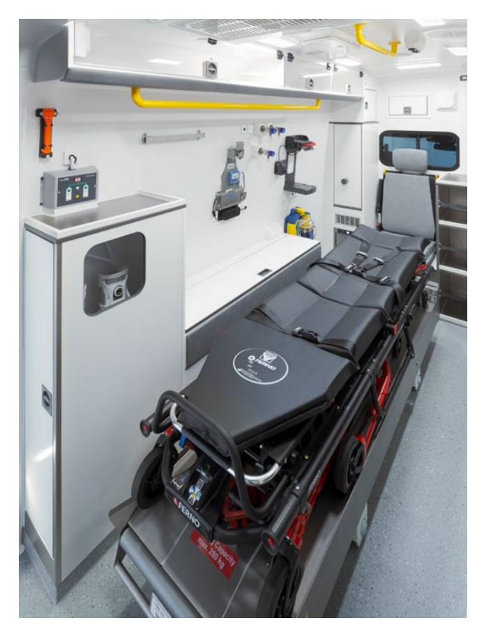
A light and friendly interior equipment offers high comfort to the patient.

engine. Continuous mobile data connectivity is guaranteed by standalone data transfer systems like 4G and KymetaTM satellite systems. By having a Ford Transit chassis, with a powerful petrol engine and a GVW of 4300 kg, this compact ambulance defines the future for both, paramedics and patients, in the present.