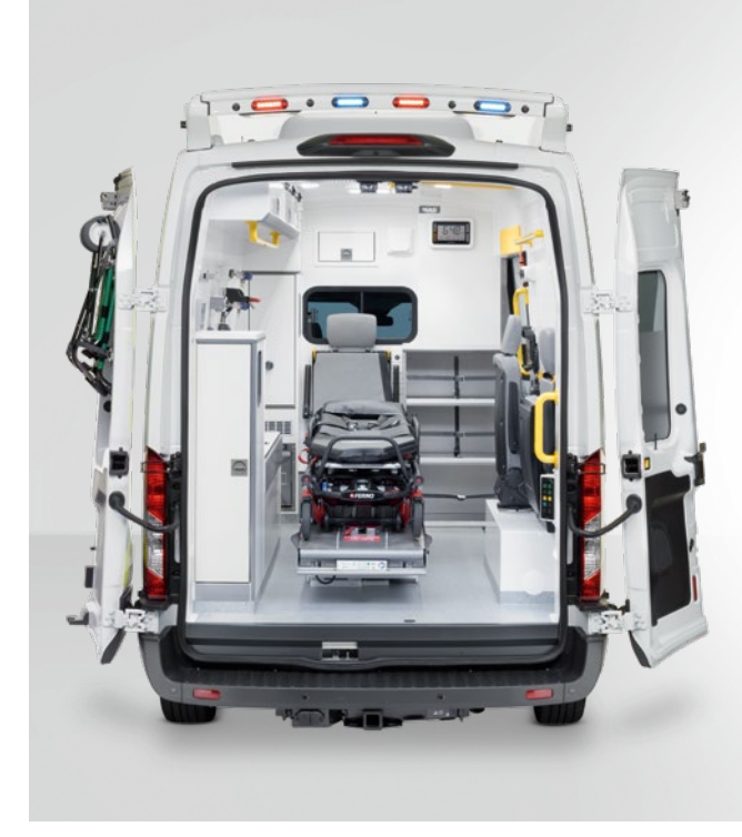
The attendant's seats are easily folded up to assure the optimal use of space and a maximum mobility.

The concept is transferable to other base vehicle types. The equipment is an example and can be customised.