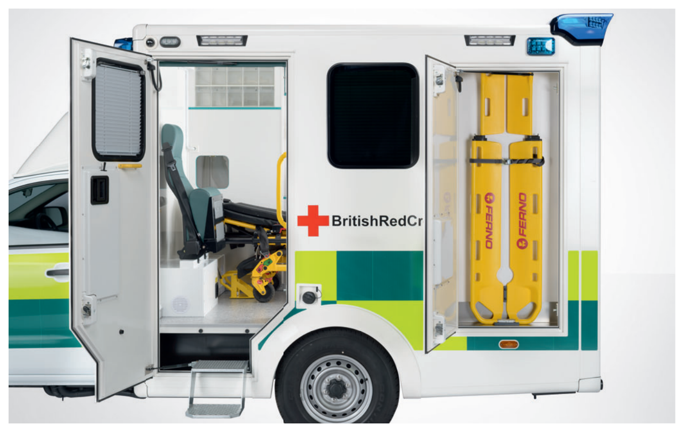
Full size saloon access door with auto deploy side step and rear external locker for scoop stretcher.