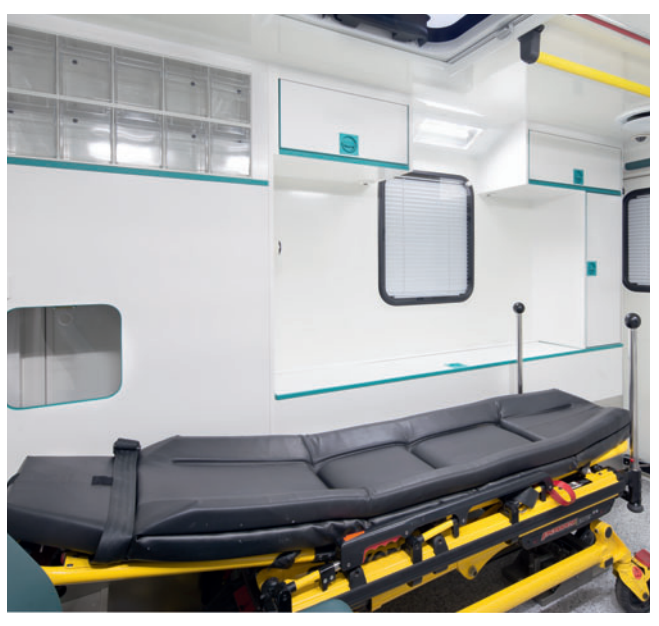
Front line stretcher capacity.