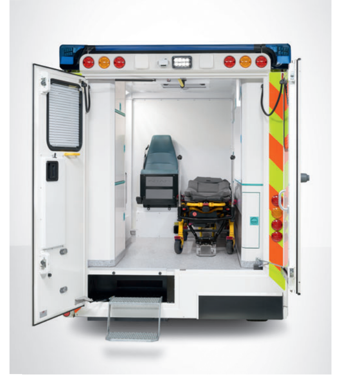
Large and wide rear access.