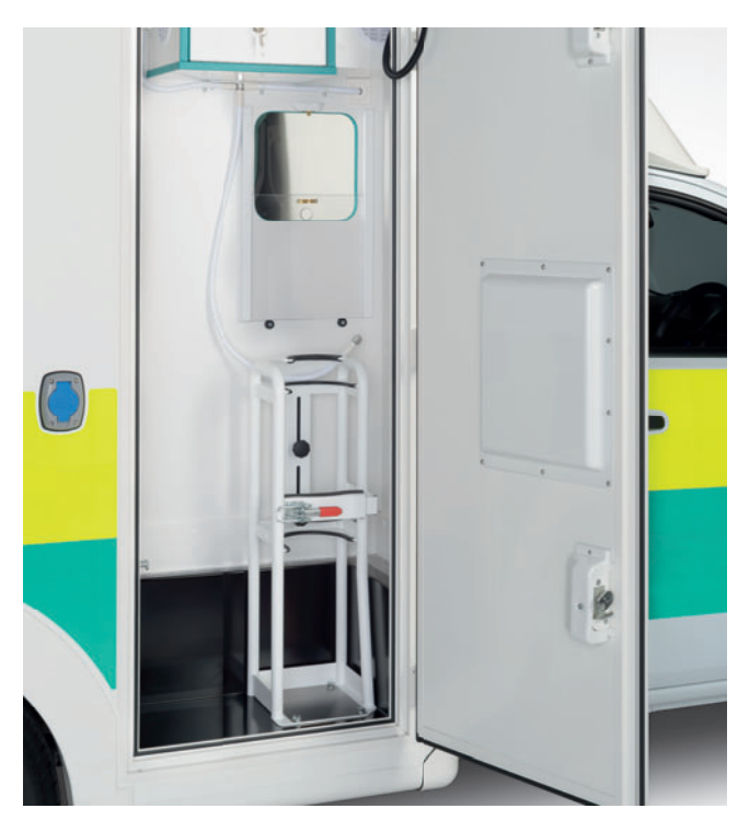
External access to medical gas storage compartment.

When conditions demand a vehicle that can go anywhere and still carry a front line specification stretcher, the new WAS 4x4 is the vehicle of choice. The new WAS 4x4 ambulance, based on the popular Ford Ranger chassis, is at home on every terrain, and equipped with ABS and full time four-wheel drive, makes this a truly 'all-round' ambulance. With a custom designed aluminium box body designed to the same standards as our front line ambulances, staff and patients can have the peace of mind they are in one of the safest 4x4 vehicles available. The WAS 4x4 is a high specification vehicle designed to meet your needs and keep staff and patients comfortable – and safe.