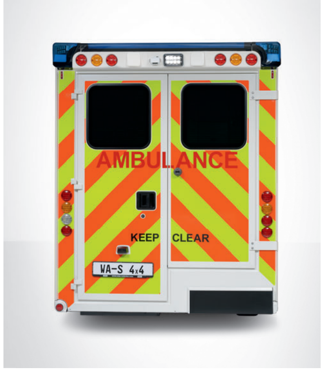
Clear design, true functionality.

The concept is transferable to other base vehicle types. The equipment is an example and can be customized.