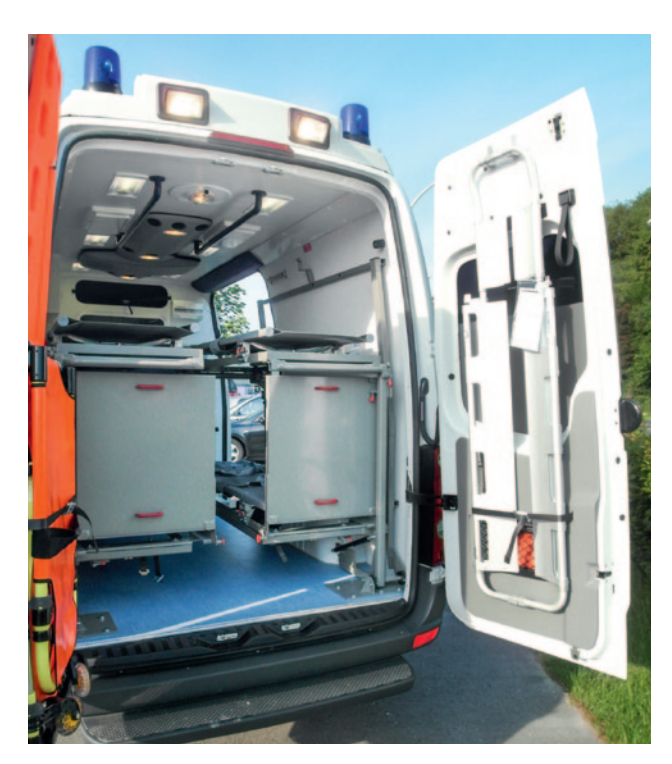
Spineboards, scoop stretchers or stretcher chairs are stored on the rear doors.

The WAS 4-stretcher ambulance has been designed for transporting casualties in the event of major catastrophes. The vehicle can transport up to four people, under medical supervision, to a nearby treatment centre for further care. All four patients can therefore be given emergency medical treatment. The stretcher brackets to the left and right can be folded up against the side walls to save space and create extra room. If necessary, the stretcher brackets are lowered in a user-friendly way to enable ergonomic loading.