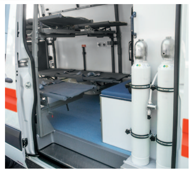
The oxygen cylinders are stowed behind the sliding side door making them easily accessible, and at the same time saving space.