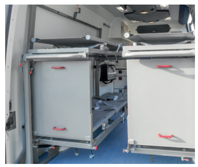
While patients are being transported, the loading ramps are simply folded away, providing additional stability.

The concept is transferable to other base vehicle types. The equipment is an example and can be customized.