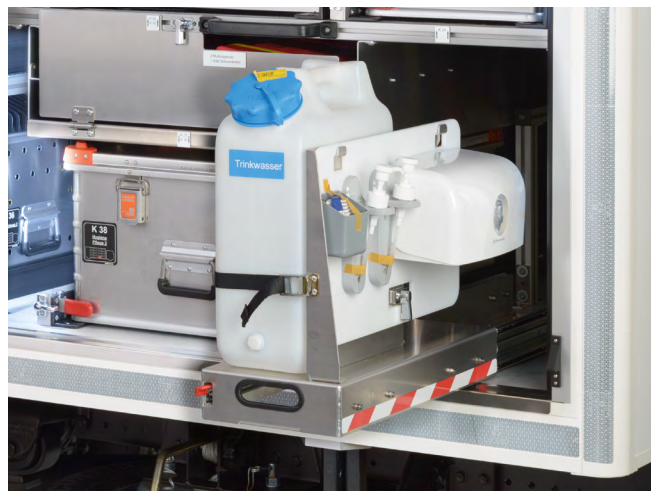
The extendible holding fixtures enable easy removal of individual pieces of equipment.

The concept is transferable to other base vehicle types. The equipment is an example and can be customized.