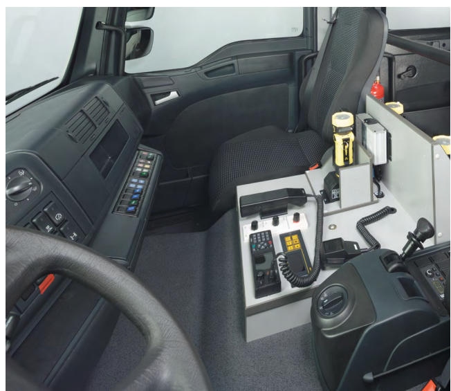
The generous centre console serves among other things to accommodate the radio system.